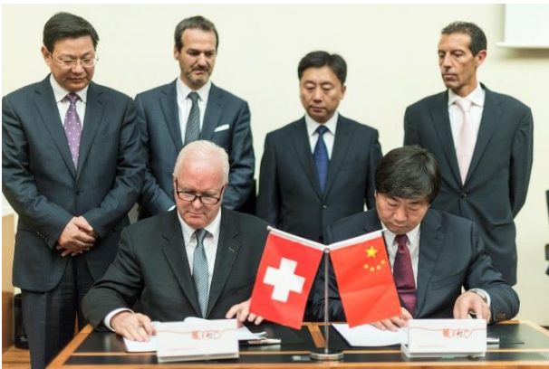
Materials for Eco-Friendly Building

Signing of Strategic Cooperation Agreements involving Chinese Public Entities, based on customized operational dynamics, and regarding specialistic developing Projects through SMEs distinctive competences. Such Public-Private Agreements recognize the strong strategic value of SMEs activities to be implemented on new markets and on wide scale.